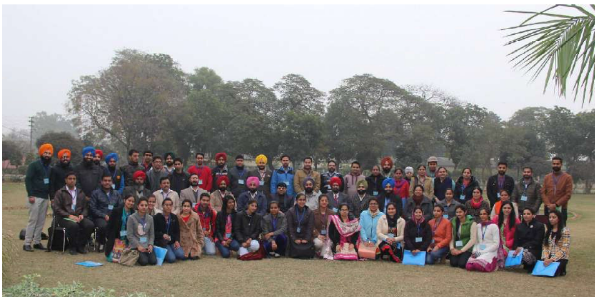
Illustration 4: Group Photograph for Workshop on Producing Elegant Technical Research Reports Efficiently (January 19 – 20, 2016)