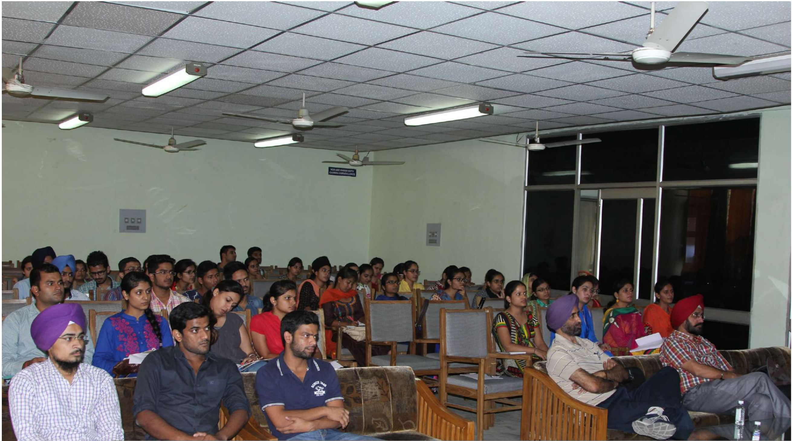
Participants attending the Workshop