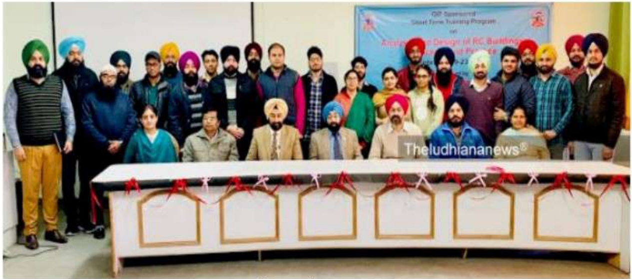
Illustration 1: Analysis and Design of RC Buildings: Concepts and Practice (19/2/2019 to 23/2/2019)