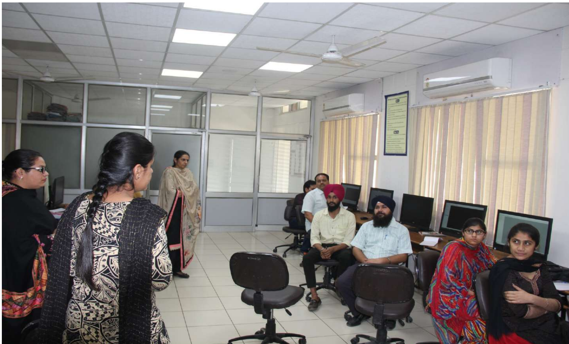
Photo: Lab session on TCAD tool – By Er. Navneet Kaur and Er. Gurpurneet Kaur (Resource Persons) from GNDEC, Ludhiana .