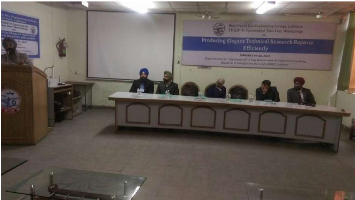
Illustration 1: Workshop on Producing Elegant Technical Research Reports Efficiently (January 19 – 20, 2016)