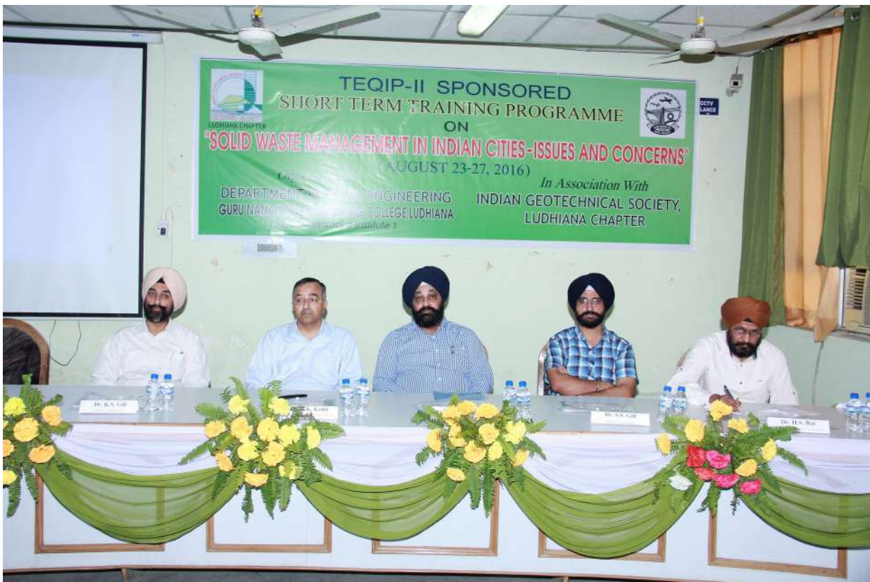
Illustration 1: Solid Waste Management in Indian Cities – Issues and Concern (2016)