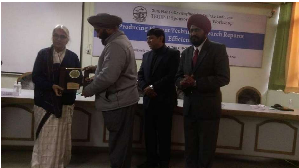
Illustration 2: Felicitation in Workshop on Producing Elegant Technical Research Reports Efficiently (January 19 – 20, 2016)