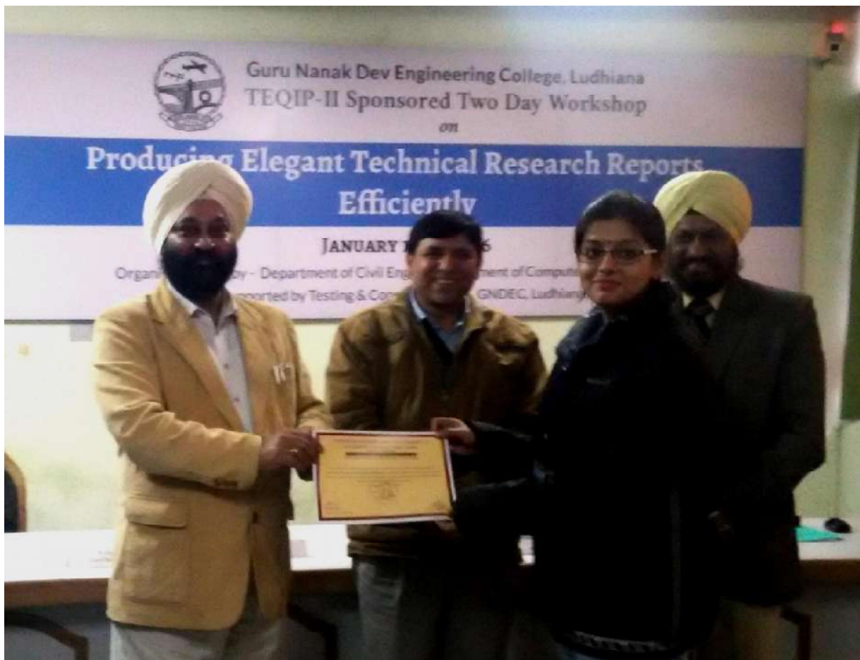
Illustration 3: Certificate distribution to Participant in Workshop on Producing Elegant Technical Research Reports Efficiently (January 19 – 20, 2016)