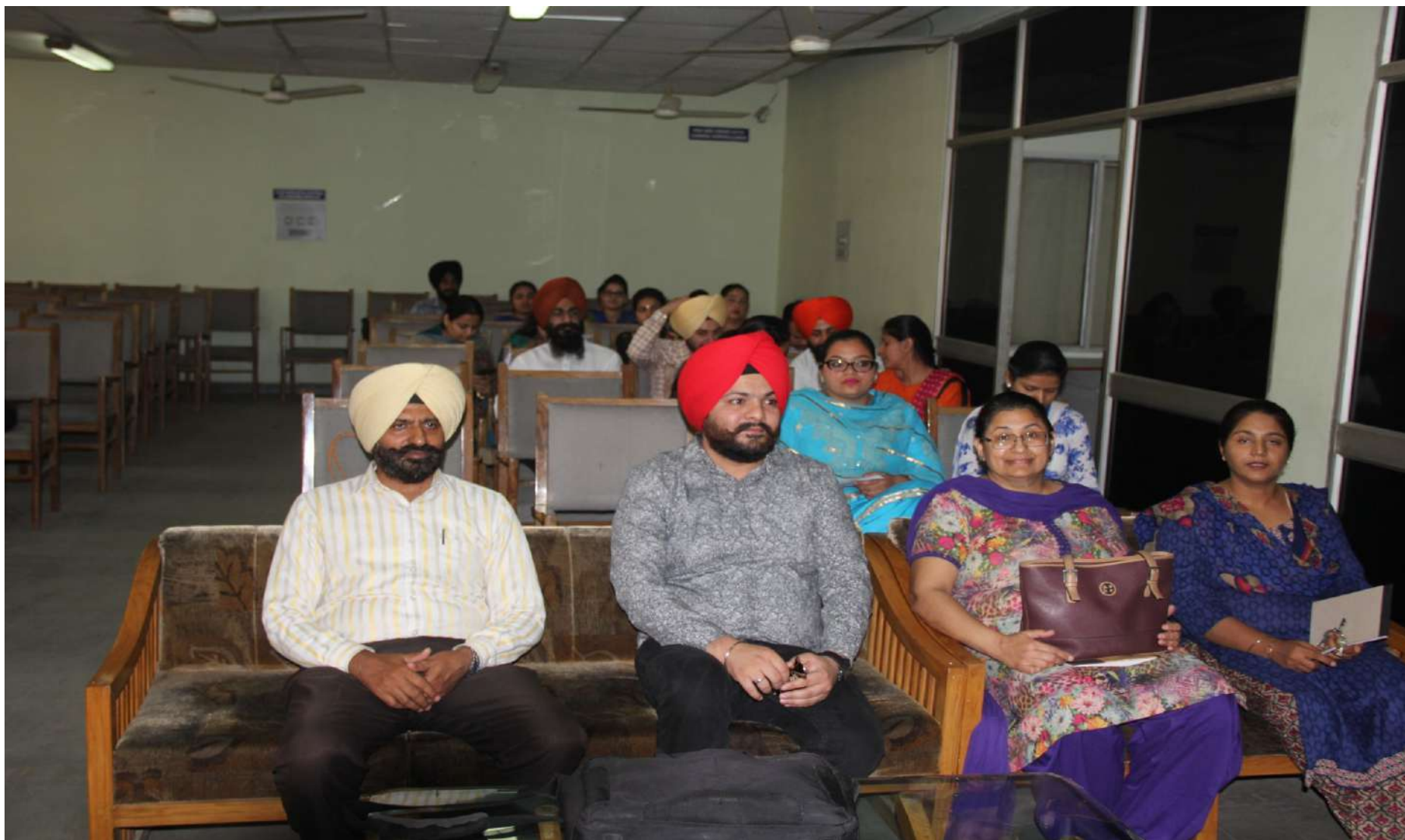
Photo: Participants of STC