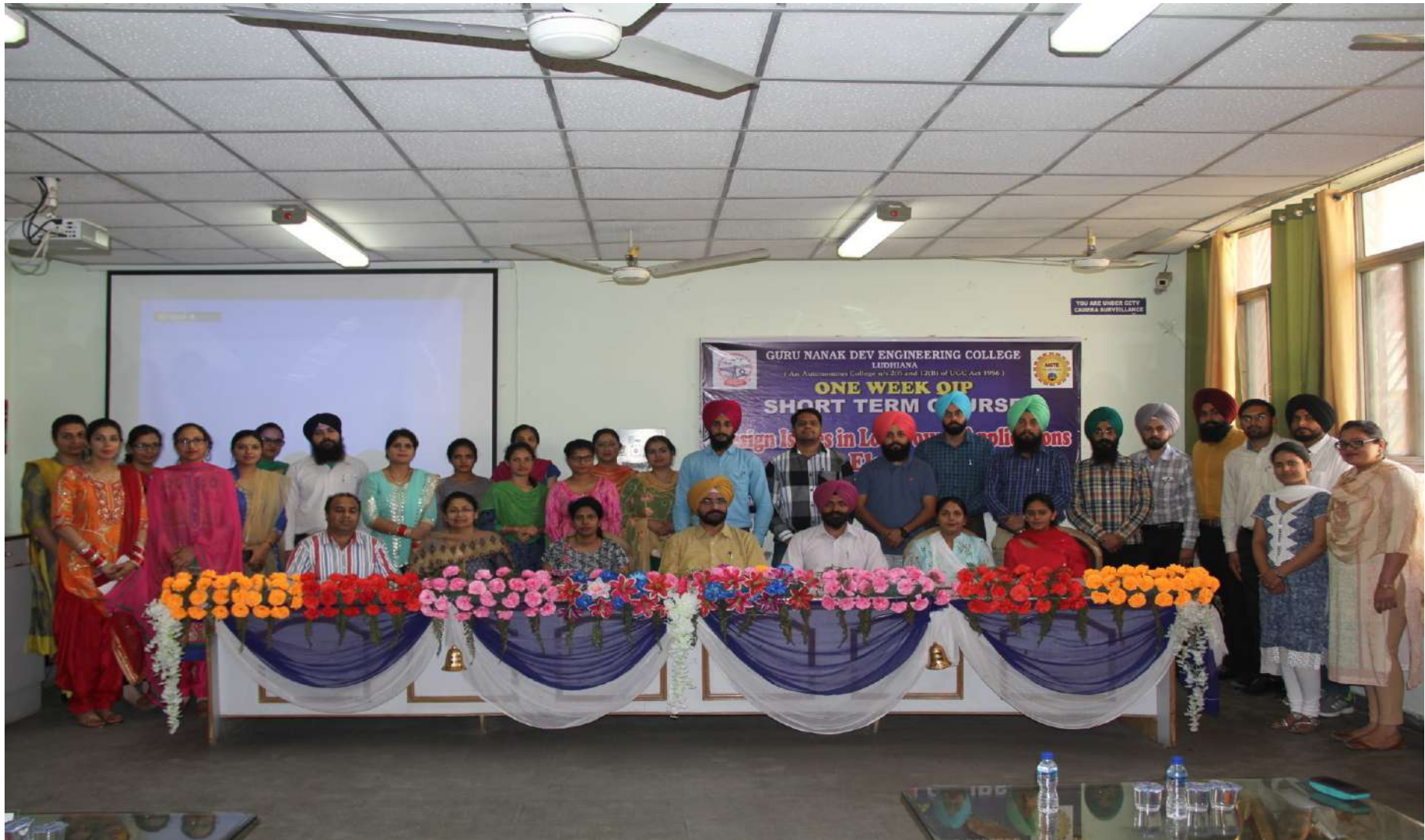
Photo: Valedictory session of STC