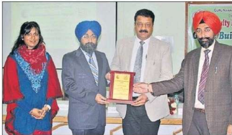
■ A guest being honoured during the inaugural function of course on 'Green Buildings and Techniques' at Guru Nanak Dev Engineering College in Ludhiana on Monday.

HINDUSTAN TIMES, JALANDHAR TUESDAY, DECEMBER 18, 2018