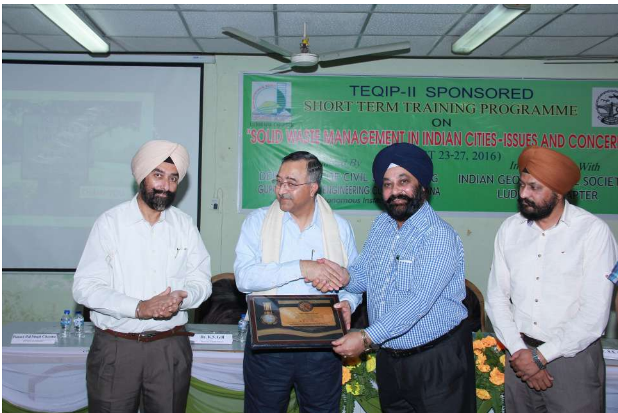
Illustration 2: Solid Waste Management in Indian Cities – Issues and Concern (2016)