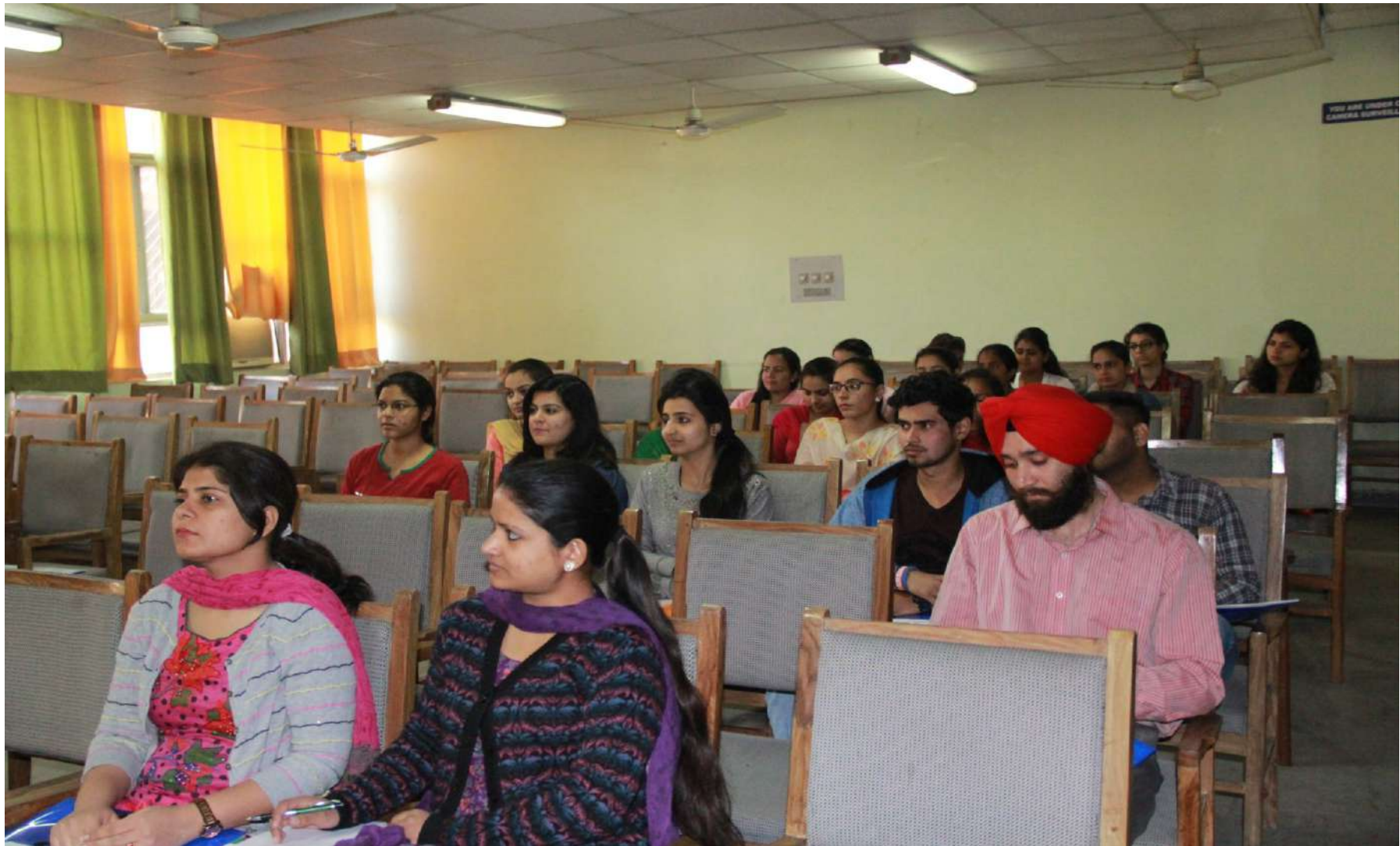
Participants during the session