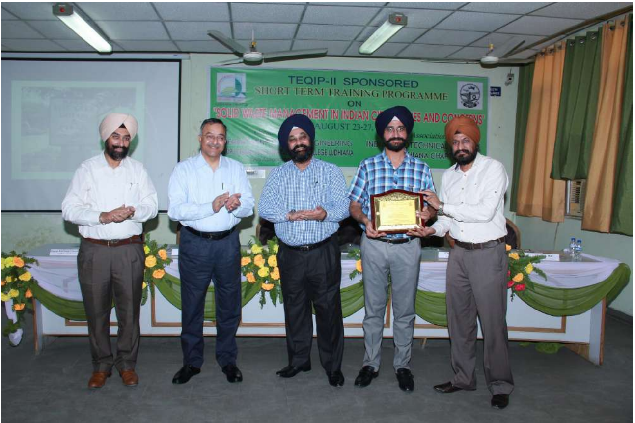
Illustration 3: Solid Waste Management in Indian Cities – Issues and Concern (2016)